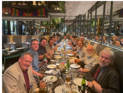
ATMI Dinner @ CMS/ATMI Conference, Miami, October 26-28, 2023.

Connect with us by emailing the details to dgoot@iu.edu , and you may find your achievements published in the next newsletter. We look forward to celebrating your successes and keeping our community vibrant!